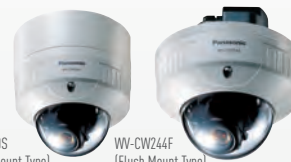
WV-CW240S (Surface Mount Type)

WV-CW500S (220-240 V AC) WV-CW504S (24 V AC or 12 V DC) WV-CW504F (24 V AC or 12 V DC)