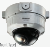
(Surface Mount Type)

WV-CW500S (220-240 V AC) WV-CW504S (24 V AC or 12 V DC) WV-CW504F (24 V AC or 12 V DC)